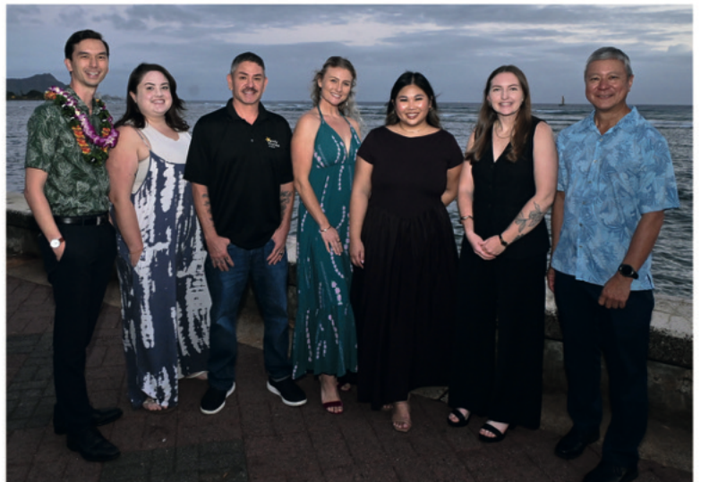
Family Promise staff at the organization's third annual Brighter Futures Gala in February.