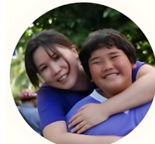
Mentoring for Positive Growth