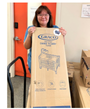
Healthy Mothers Healthy Babies