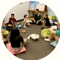
Peer Support Groups

Kids Hurt Too Hawaii offers a free and safe place for children and youth with grief and trauma, ages 3 -19, as well as support for their caregivers. We provide the following services to children who have lost one or both parents: