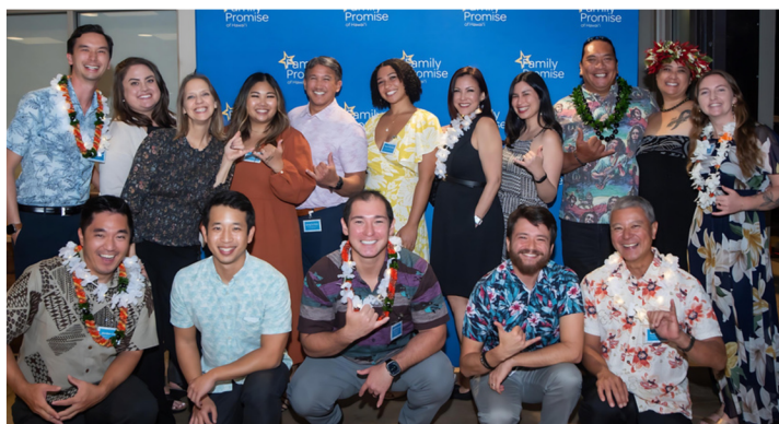
Family Promise Board Members and Staff

Family Promise of Hawai‘i (FPH) continues to grow to prevent and end homelessness for more children and families, as the need for our services has only been increasing over the past few years. As we expand, community support is more important than ever. If you’d like to host a supply drive, volunteer, or donate to support our mission, please visit familypromisehawaii.org . Here are a few quick facts about our work: