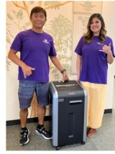
Kids Hurt Too Hawaii