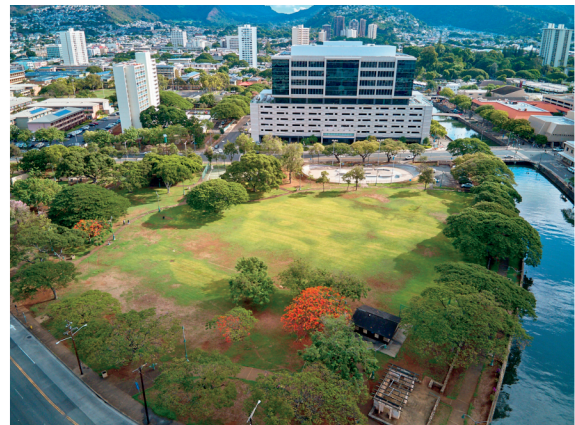
American Savings Bank Overlooks A'ala Park

Their plans include a lot of green space, areas for picnics, sports and games, exercise, community gardens and possibly special events. This creates an exciting opportunity not just for the area businesses and nonprofits such as the Kukui Center, but also the more than 18,000 people who live within a 10 minute walking distance. "Natural spaces and public parks play a vital role in the health of whole neighborhoods. We are so excited to work with community members living and working around A'ala Park as we develop a shared vision for the future of the park" said Sultan White, Parks for People Program Manager at the Trust for Public Land.